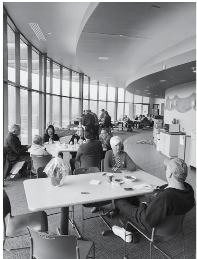
Members gather inside MLSIC's where the MPVA's office is located for Awareness Day!

This year's MPVA Awareness Day held on April 11, 2019 at our new chapter headquarters in Plymouth. MPVA members, community leaders and the attending public had an opportunity to compare and review independent