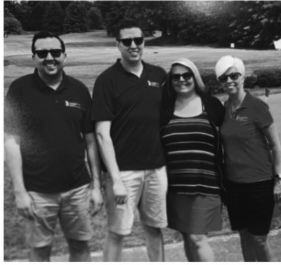
MPVA team and friends pose for a photo at the St. Michael's Lutheran Golf Outing that took place on June 21, 2019!