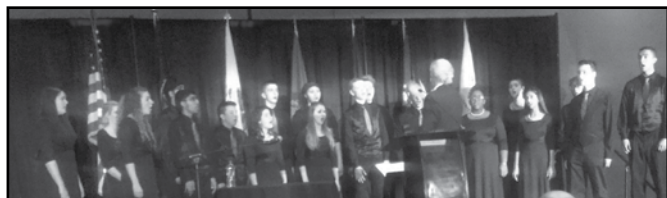
Novi Choir Students share their gift of song at the 2017 Salute to Veterans Gala.

O n November 10, 2017, the Michigan Paralyzed Veterans of America (MPVA) celebrated Veterans Day by hosting our Annual “Salute to Veterans” Dinner, at the Suburban Collection Showplace, in Novi. Nearly 200 guests gathered to pay tribute to Michigan’s Veterans of the past and present.