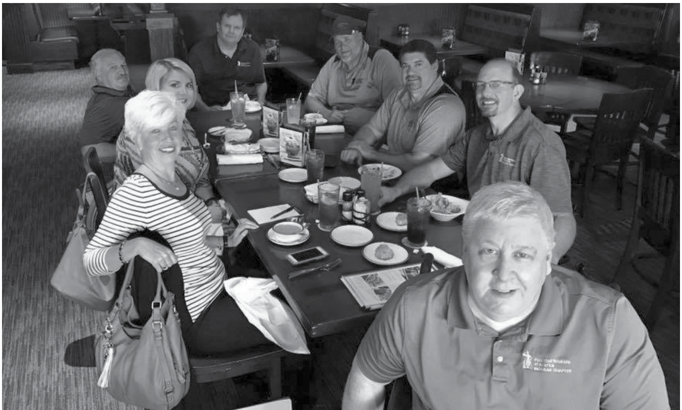
MPVA Board of Directors meet this past summer to discuss all that is happening at the Chapter.

By September, the Board had reviewed three different realtor opinions and voted for one of the realtors to represent us in our listing. We were pleased with the potential profit that we could