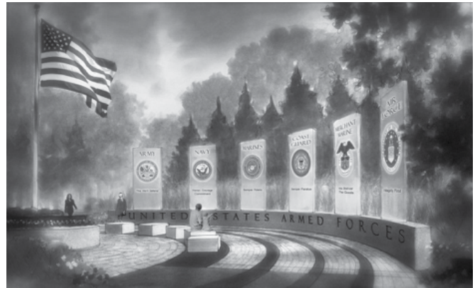
Artist Rendition of the Tribute

The residents of Oakland Township and Oakland County have been extremely generous. Local and regional businesses have been equally generous – having contributed material, services and pledges to construct significant portions of the Tribute.