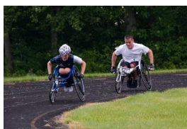
Above: The Michigan Wheelchair Game athletes compete to the finish line!