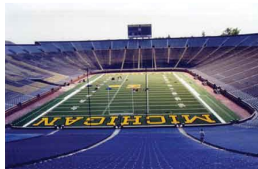
Above: The 2008 Michigan football season introduced renovated wheelchair accessible seating to Michigan football fans due to a landmark agreement between MPVA, Department of Justice (DOJ), and U of M.