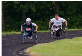
Above: The Michigan Wheelchair Game athletes compete to the finish line!