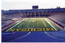
Above: The 2008 Michigan football season introduced renovated wheelchair accessible seating to Michigan football fans due to a landmark agreement between MPVA, Department of Justice (DOJ), and U of M.